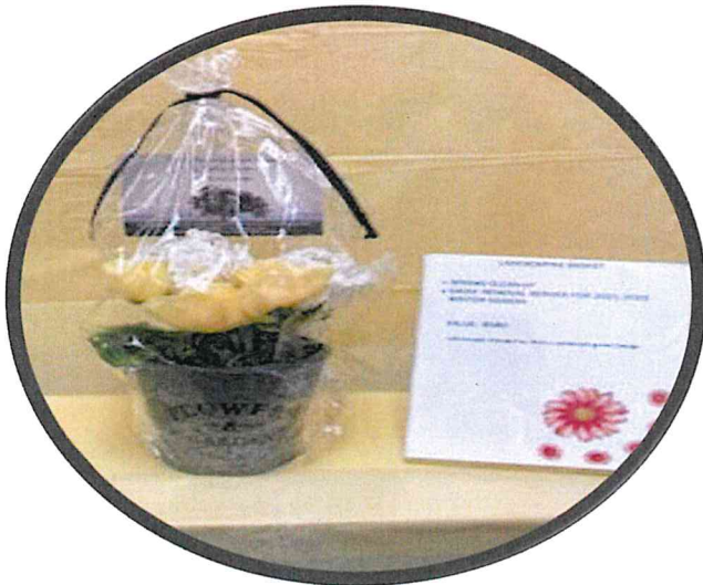
#1 LANDSCAPING BASKET - VALUE $580 SPRING CLEAN-UP SNOW REMOVAL FOR WINTER SEASON 2021-22

EXTRA TICKETS CAN BE BOUGHT AT THE SCHOOL OFFICE OR PARISH OFFICE