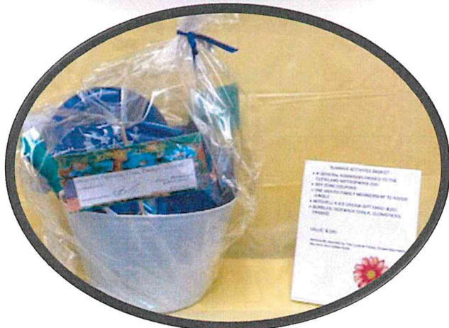
#3 SUMMER ACTIVITIES BASKET - VALUE $190 4 - PASSES TO CLEVELAND ZOO SKY ZONE COUPONS ONE MONTH PASS TO KIDDIE JUNGLE MITCHELL'S GIFT CARD ($20) OUTDOOR FUN SUPPLIES FOR KIDS