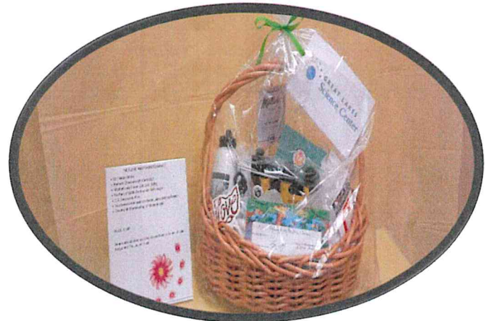
#4 THE CLEVELAND FAVORITES BASKET - VALUE $180 CLE WATER BOTTLE, DECALS & PINS MALLEY'S CHOCOLATE GIFT CARD ($20) MITCHELL'S ICE CREAM GIFT CARD ($20) SIX PACK OF GLBC DORTMUNDER GOLD LAGER 2 - GENERAL ADMISSIONS TO GREAT LAKES SCIENCE CTR ONE MONTH PASS TO KIDDIE JUNGLE

LANDSCAPING BASKET TICKETS - $5.00 EACH **ALL OTHER BASKET TICKETS - $1.00 EACH OR SIX FOR $5.00 PLEASE FILL OUT THE TICKETS ON THE BACK AND EITHER DROP THEM IN THE SUNDAY BASKET OR AT THE PARISH OFFICE. DRAWING IS MAY 23, 2021 AFTER 6:30 PM MASS