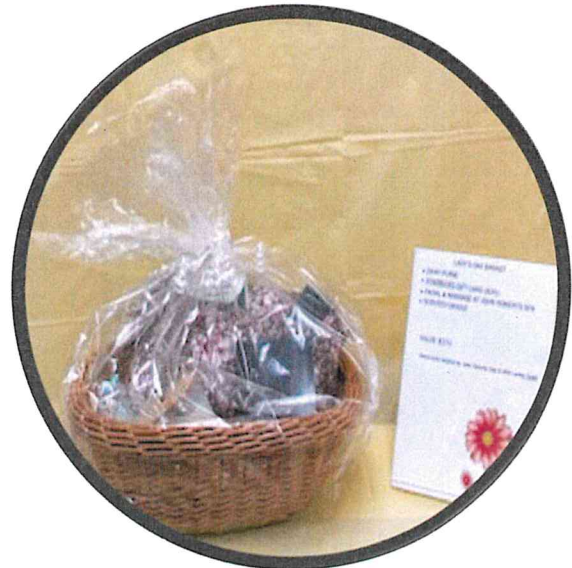
#2 LADY'S DAY BASKET - VALUE $270 DKNY PURSE STARBUCKS GIFT CARD ($20) FACIAL & MASSAGE JOHN ROBERTS SPA SCENTED CANDLE